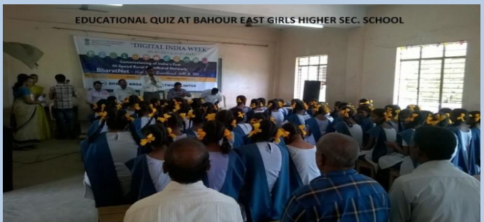
QUIZ @ BAHOUR EAST GIRL SCHOOL