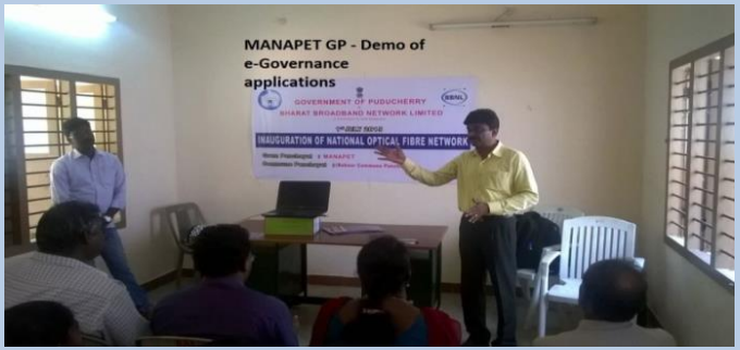
E-GOVERNANCE @ MANAPET GP