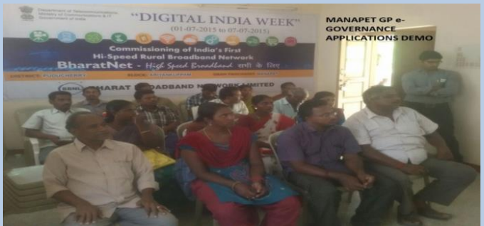
E-GOVERNANCE @ MANAPET GP