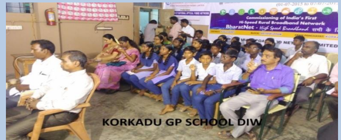
KORKADU GP SCHOOL DIW