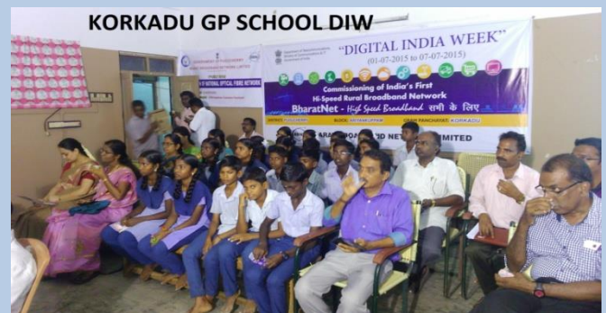
KORKADU GP SCHOOL DIW

The National Optical Fibre Network was conceptualized by the Govt. of India in the year 2012. The Project is funded from the Universal Service Obligation Fund (USOF) at a cost of about 20,000 crores connecting 2.5 lakh Gram Panchayats spread across the entire country. Govt. of India has formed a Special Purpose Vehicle (SPV), viz., Bharat Broadband Network Limited under the Ministry of Communication and IT to execute the Project. As part of this Project in Pondicherry UT, 98 Gram Panchayats in 3 Blocks viz., Villianur, Ariyankuppam and Karaikal are connected with High speed Rural Broadband facility on Optical Fiber Cable link (OFC) at a cost of about Rs.3.5 crores. This connectivity will facilitate delivery of citizen-centric services on real time basis at a faster speed. The Project was executed in about six months by Railtel Corporation with active support of the Pondicherry State Government and BSNL.