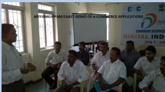
DEMO e-COMMERCE @ ARAIYANKUPPAM