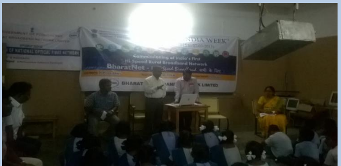
QUIZ @ KORKADU HR. SEC. SCHOOL