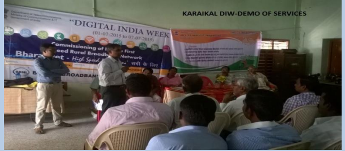
DIW CELEBRATION @ BDO OFFICE KARAIKAL

The importance and the benefits of NOFN Network to the State Govt. and the delivery of citizen centric services through Common Service Centres were explained to the audience. Hands on experience of internet facility was extended to the audience. The benefits of internet in day to day usage for various activities like utility bill payments, agricultural information, on line ticket booking etc were demonstrated to the audience.