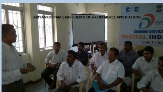
DEMO e-COMMERCE @ ARIYANKUPPAM