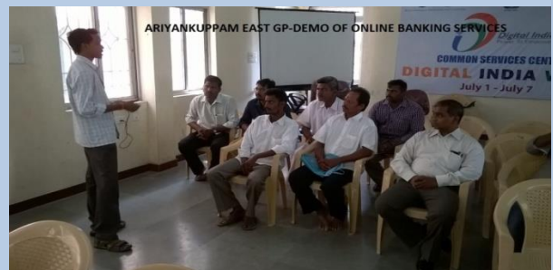
DEMO e-COMMERCE @ ARAIYANKUPPAM