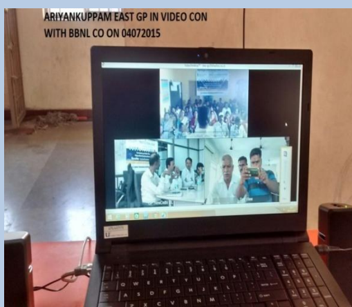
IN VEDIO CON WITH BBNL CO