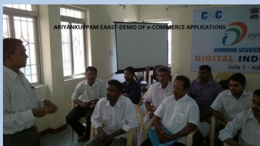
DEMO e-COMMERCE @ ARIYANKUPPAM