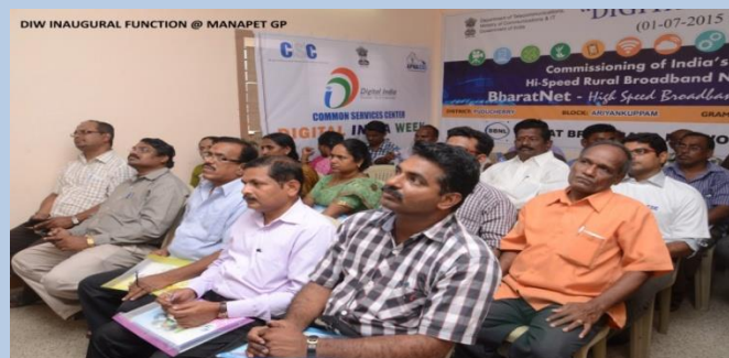
DIW MANAPET GP