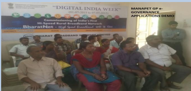
E-GOVERNANCE @ MANAPET GP