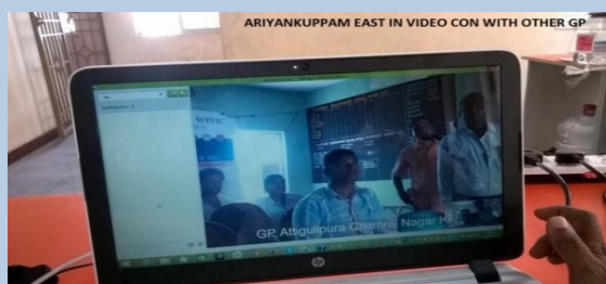
IN VEDIO CON WITH OTHER GP