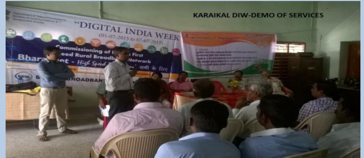
DIW CELEBRATION @ BDO OFFICE KARAIKAL

The importance and the benefits of NOFN Network to the State Govt. and the delivery of citizen centric services through Common Service Centres were explained to the audience. Hands on experience of internet facility was extended to the audience. The benefits of internet in day to day usage for various activities like utility bill payments, agricultural information, on line ticket booking etc were demonstrated to the audience.