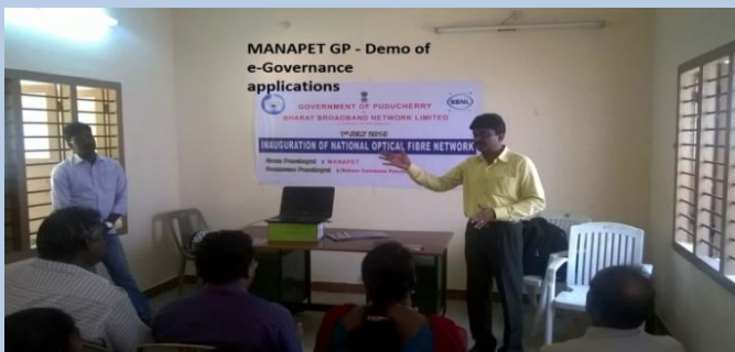
E-GOVERNANCE @ MANAPET GP