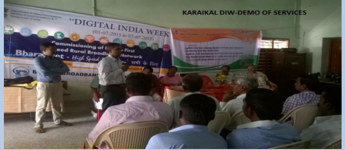
DIW CELEBRATION @ BDO OFFICE KARAIKAL

The importance and the benefits of NOFN Network to the State Govt. and the delivery of citizen centric services through Common Service Centres were explained to the audience. Hands on experience of internet facility was extended to the audience. The benefits of internet in day to day usage for various activities like utility bill payments, agricultural information, on line ticket booking etc were demonstrated to the audience.