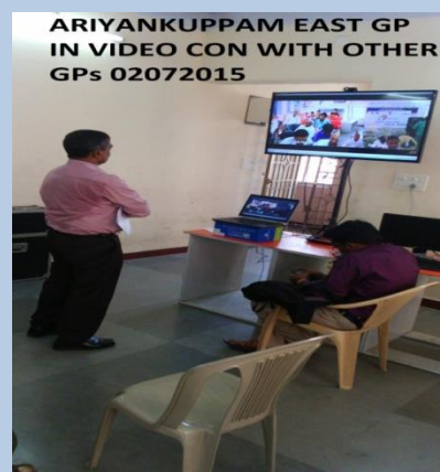
IN VEDIO CON WITH OTHER GP