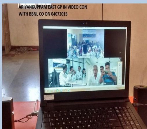
IN VEDIO CON WITH BBNL CO