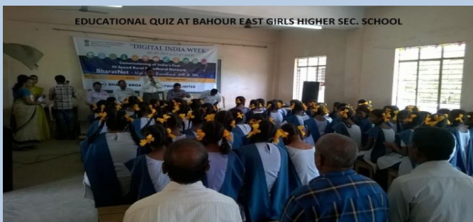
QUIZ @ BAHOUR EAST GIRL SCHOOL