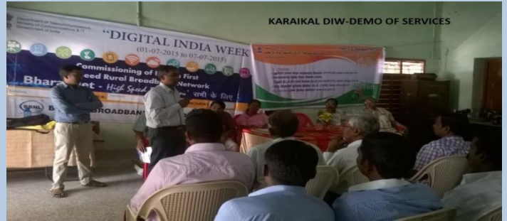
DIW CELEBRATION @ BDO OFFICE KARAIKAL

The importance and the benefits of NOFN Network to the State Govt. and the delivery of citizen centric services through Common Service Centres were explained to the audience. Hands on experience of internet facility was extended to the audience. The benefits of internet in day to day usage for various activities like utility bill payments, agricultural information, on line ticket booking etc were demonstrated to the audience.