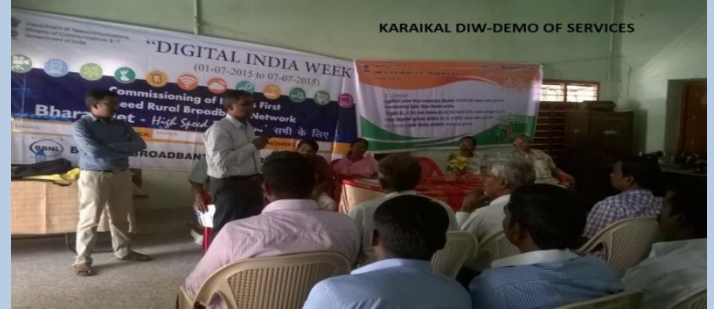
DIW CELEBRATION @ BDO OFFICE KARAIKAL

The importance and the benefits of NOFN Network to the State Govt. and the delivery of citizen centric services through Common Service Centres were explained to the audience. Hands on experience of internet facility was extended to the audience. The benefits of internet in day to day usage for various activities like utility bill payments, agricultural information, on line ticket booking etc were demonstrated to the audience.