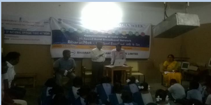
QUIZ @ KORKADU HR. SEC. SCHOOL