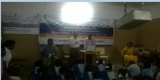
QUIZ @ KORKADU HR. SEC. SCHOOL