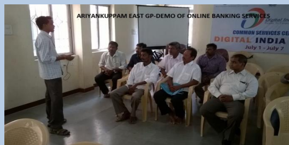
DEMO e-COMMERCE @ ARIYANKUPPAM