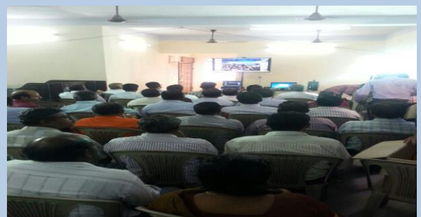
DIW CELEBRATION @ ARIYANKUPPAM EAST GP