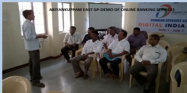
DEMO e-COMMERCE @ ARIYANKUPPAM