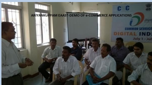
DEMO e-COMMERCE @ ARIYANKUPPAM