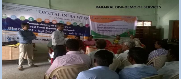
DIW CELEBRATION @ BDO OFFICE KARAIKAL

The importance and the benefits of NOFN Network to the State Govt. and the delivery of citizen centric services through Common Service Centres were explained to the audience. Hands on experience of internet facility was extended to the audience. The benefits of internet in day to day usage for various activities like utility bill payments, agricultural information, on line ticket booking etc were demonstrated to the audience.