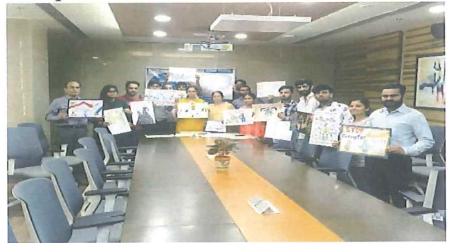
Participants of Poster making competition

Poster making on the central theme “Integrity – A way of Life” was conducted in BBNL Corporate office.