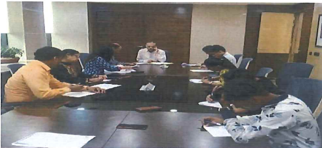
Quiz competition in progress in BBNL Corporate Office, New Delhi on 30.10.2019

Subject: Vigilance Awareness Week-2019- Result of Optional Type Question/ Answer Examination.