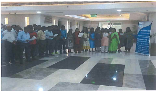
Pledge Taking Ceremony in the BBNL Corporate Office, New Delhi on 28.10.2019

Pledge was also taken by various officers and staff in BBNL PMUs throughout the country on 28-10-2019 at 11.00 am.