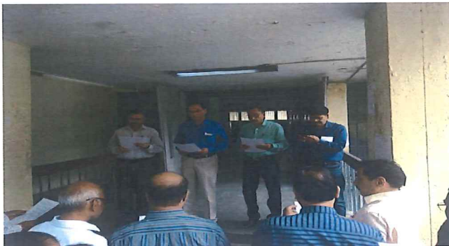
Pledge Taking Ceremony in the BBNL Office, UP (W)

Pledge was also taken by various officers and staff in BBNL PMUs throughout the country on 28-10-2019 at 11.00 am.