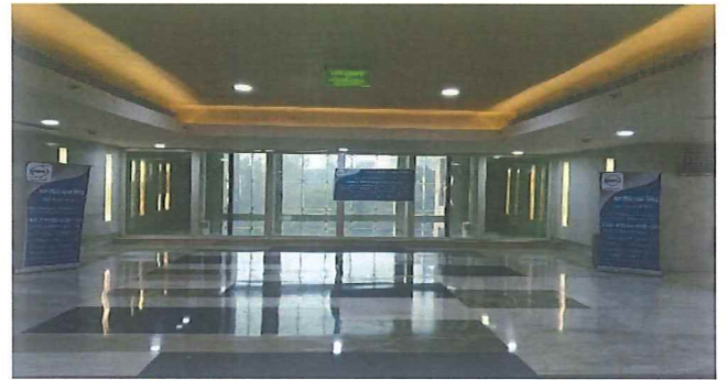
Display of banners in BBNL CO New Delhi