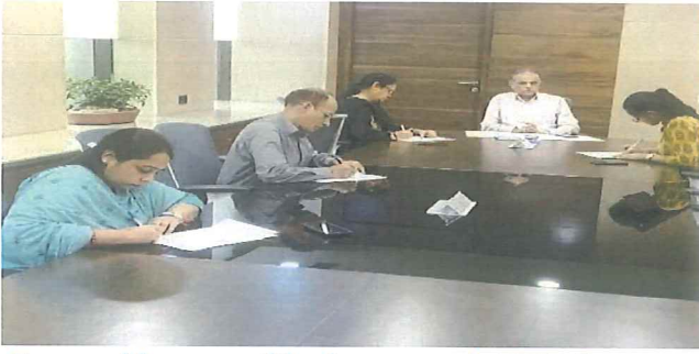
Essay writing competition in progress in BBNL Corporate Office on 30.10.2019

Following participants were declared as winners: