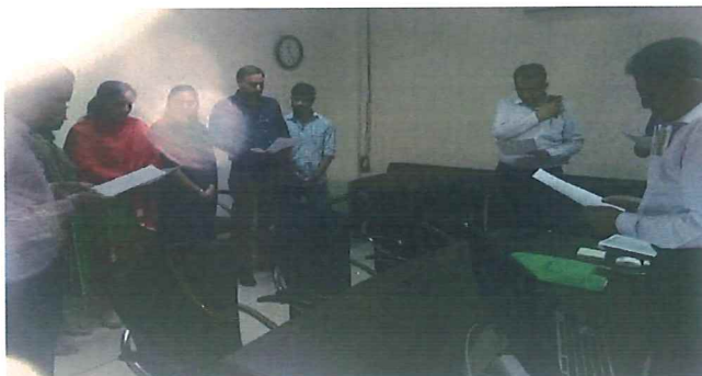
Pledge Taking Ceremony in the BBNL Office, Punjab