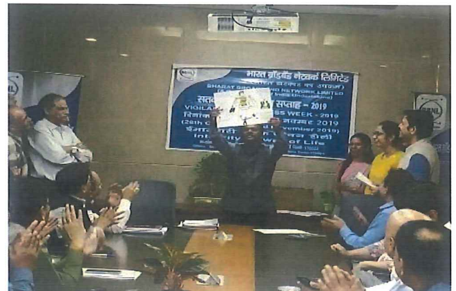
CMD BBNL displaying the First Prize winning poster