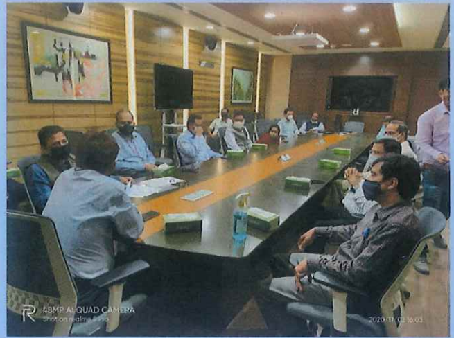
CMD BBNL presiding over the VAW closing ceremony