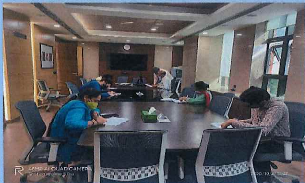
Essay writing competition in progress in BBNL Corporate Office on 27.10.2020

Following participants were declared as winners: