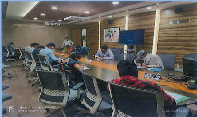
A number of the officers & staff participated in the competition.