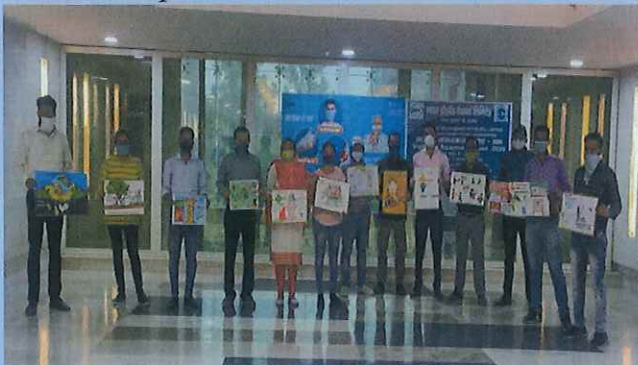
Participants of Poster making competition in BBNLCO

Poster making on the central theme “Satark Bharat, Samriddh Bharat” was conducted in BBNL Corporate office.