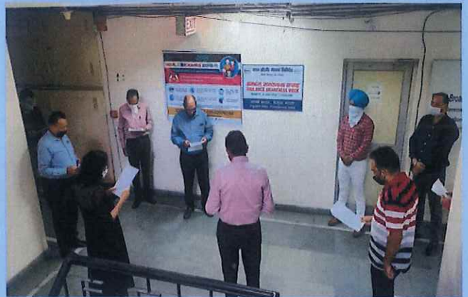
Pledge Taking Ceremony in the BBNL Office, Punjab