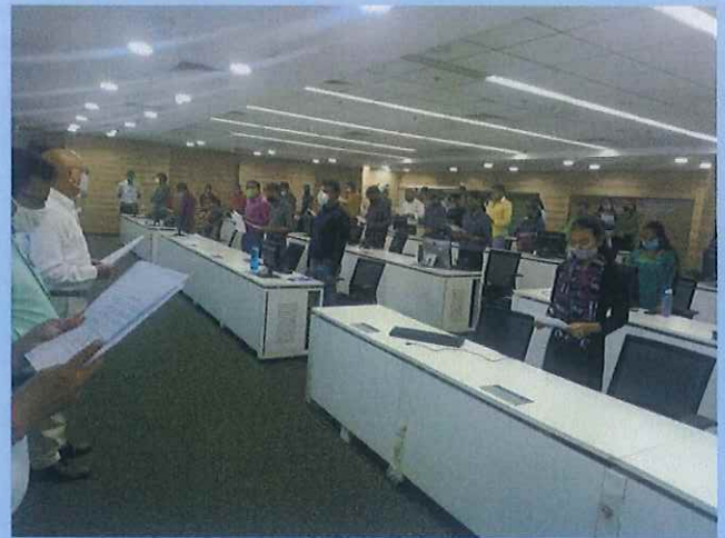
Pledge Taking Ceremony in the BBNL Branch Office, New Delhi on 27.10.2020

Pledge was also taken by various officers and staff in BBNL PMUs throughout the country on 27-10-2020 at 11.00 am.