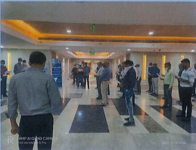
Pledge Taking Ceremony in the BBNL Corporate Office, New Delhi on 27.10.2020

Pledge was also taken by various officers and staff in BBNL PMUs throughout the country on 27-10-2020 at 11.00 am.