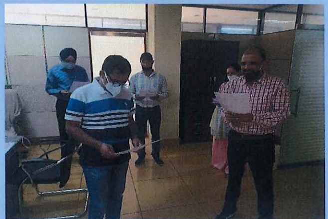
Pledge Taking Ceremony in the BBNL Office, Haryana