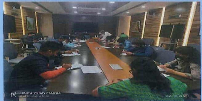
Quiz competition in progress in BBNL Corporate Office, New Delhi on 28.10.2020