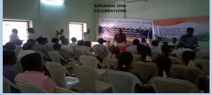
DIW CELEBRATION @ BDO OFFICE KARAIKAL