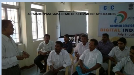
DEMO e-COMMERCE @ ARIYANKUPPAM