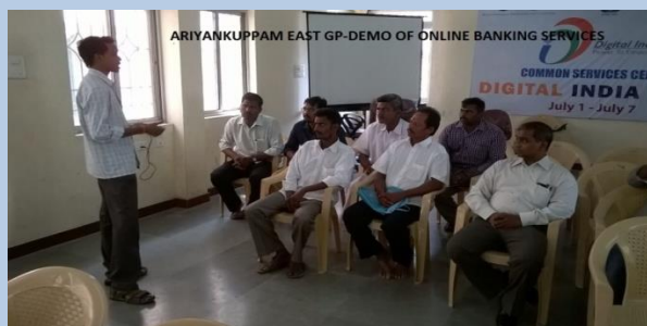
DEMO e-COMMERCE @ ARIYANKUPPAM